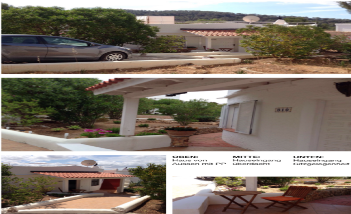
OBEN: Haus von Aussen mit PP MITTE: Hauseingang überdacht UNTEN: Hauseingang Sitzgelegenheit